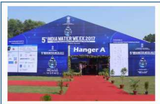
5 th India Water Week 2017

Theme: Water and Energy for Inclusive Growth