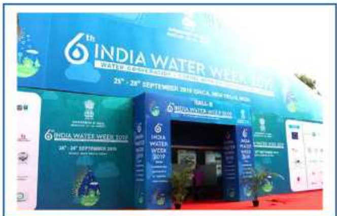
6 th India Water Week 2019

Theme: Water and Energy for Inclusive Growth