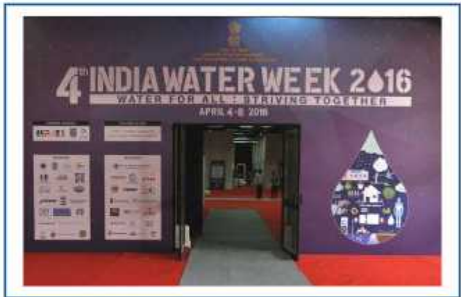
4 th India Water Week 2016

Theme: Water Management for Sustainable Development