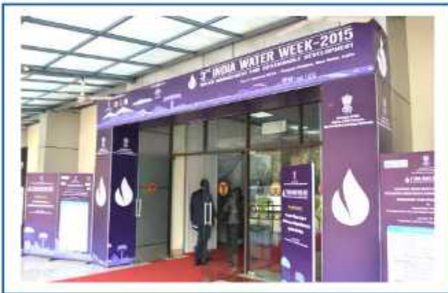
3 rd India Water Week 2015

Theme: Efficient Water Management: Challenges and Opportunities