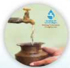
Jal Jeevan Mission