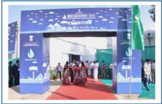
2 nd India Water Week 2013

Theme: Water, Energy and Food Security: Call for Solutions