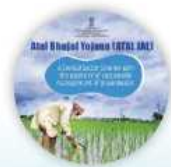
Atal Bhujal Yojana