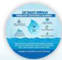
Jal Shakti Abhiyan