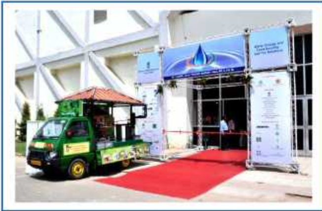
1 st India Water Week 2012

Theme: Water, Energy and Food Security: Call for Solutions