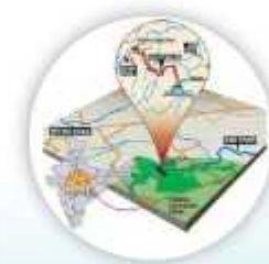
Ken-Betwa link Project